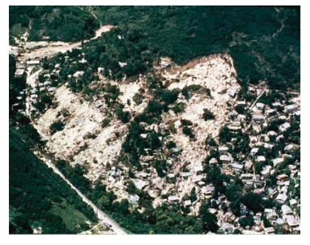
Photo of the 1985 Mameyes Landslide; See Mameyes Ward article on page 4. (http://upload.wikimedia.org/wikipedia/ commons/9/98/Mameyes.jpg)

McLuckie, B.F., 1974: Warning-A Call to Action: Warning and Disaster Response- A Sociological Background. NWS Southern Region Headquarters, 85 pp.